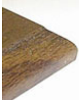
Walnut Edge Melamine