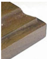
Solid Walnut Edge 1