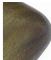
SW Rounded Corner